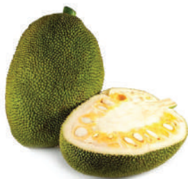
Fresh Jack Fruit