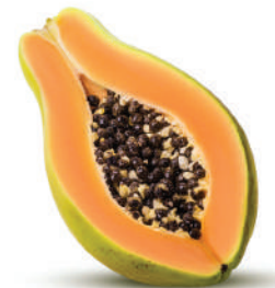
Fresh Paw Paw