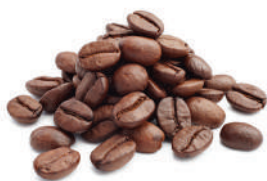
Rosted Coffee Beans