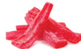
Dried Paw Paw