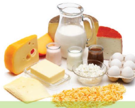
Milk, Yogurt, Cheese, Eggs