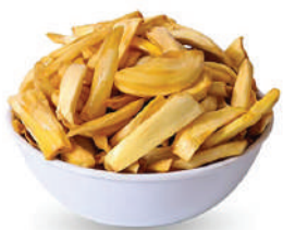
Dried Jack Fruit