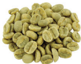
Green Coffee Beans